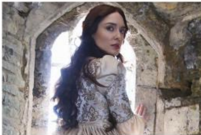
Mallory Jansen in “Galavant”

TOPICS: GALAVANT, MALLORY JANSEN, TV, ENTERTAINMENT NEWS